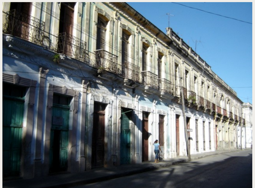
Republican buildings. s. XX