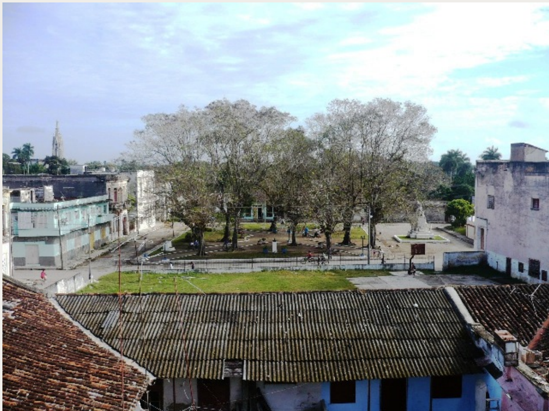
City's Founding Place