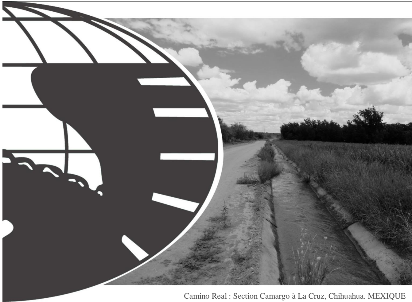
Camino Real : Section Camargo à La Cruz, Chihuahua. MEXIQUE