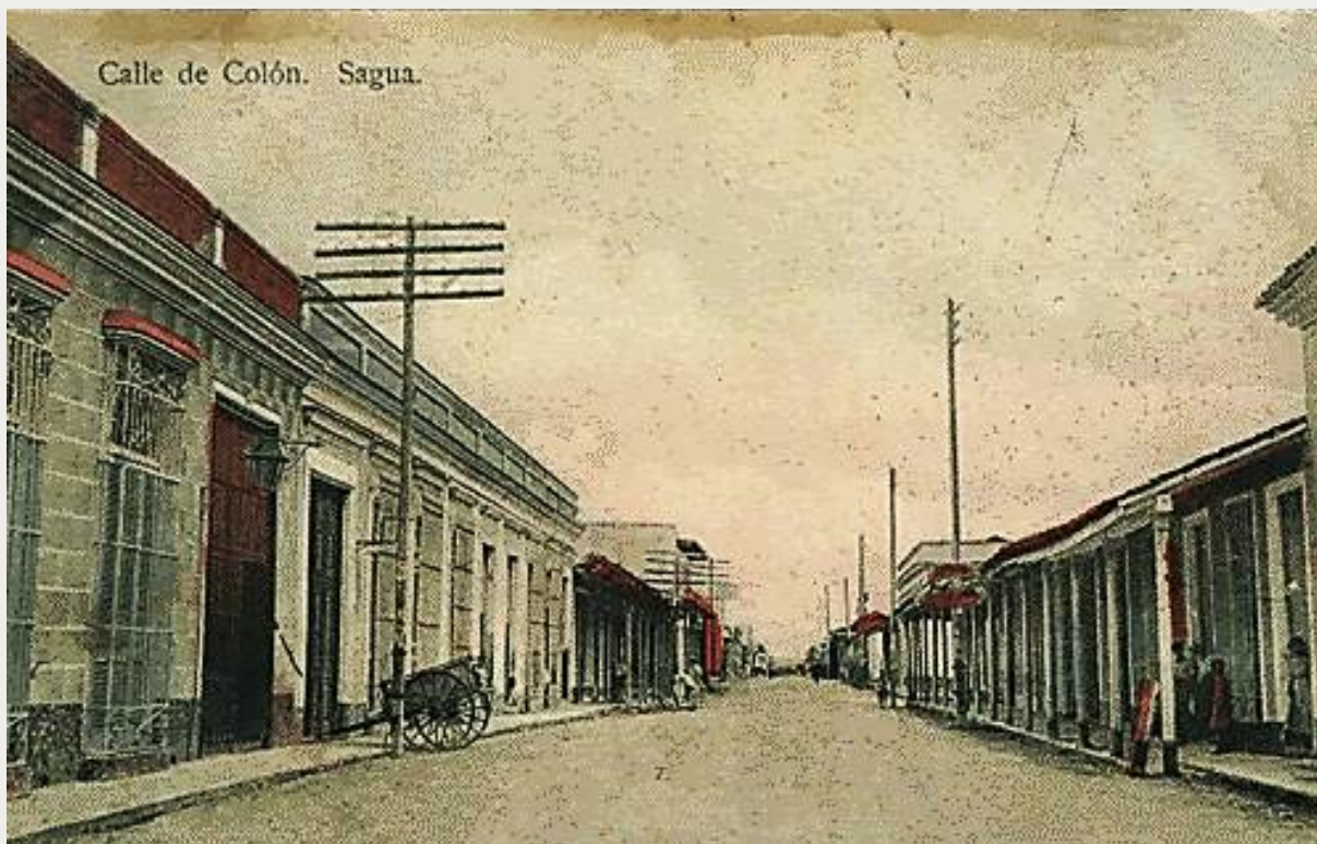
A View of Sagua by the end of s. XIX

Sagua La Grande, a XIX century city, is an outstanding exponent of the Neoclassical style in Architecture in all of Cuba. During the second half of that century, a great number of towns and cities are being born in the country, due to the expansion of sugar industry. Many of the countryside people started to group in the emerging towns, around the sugar mills.