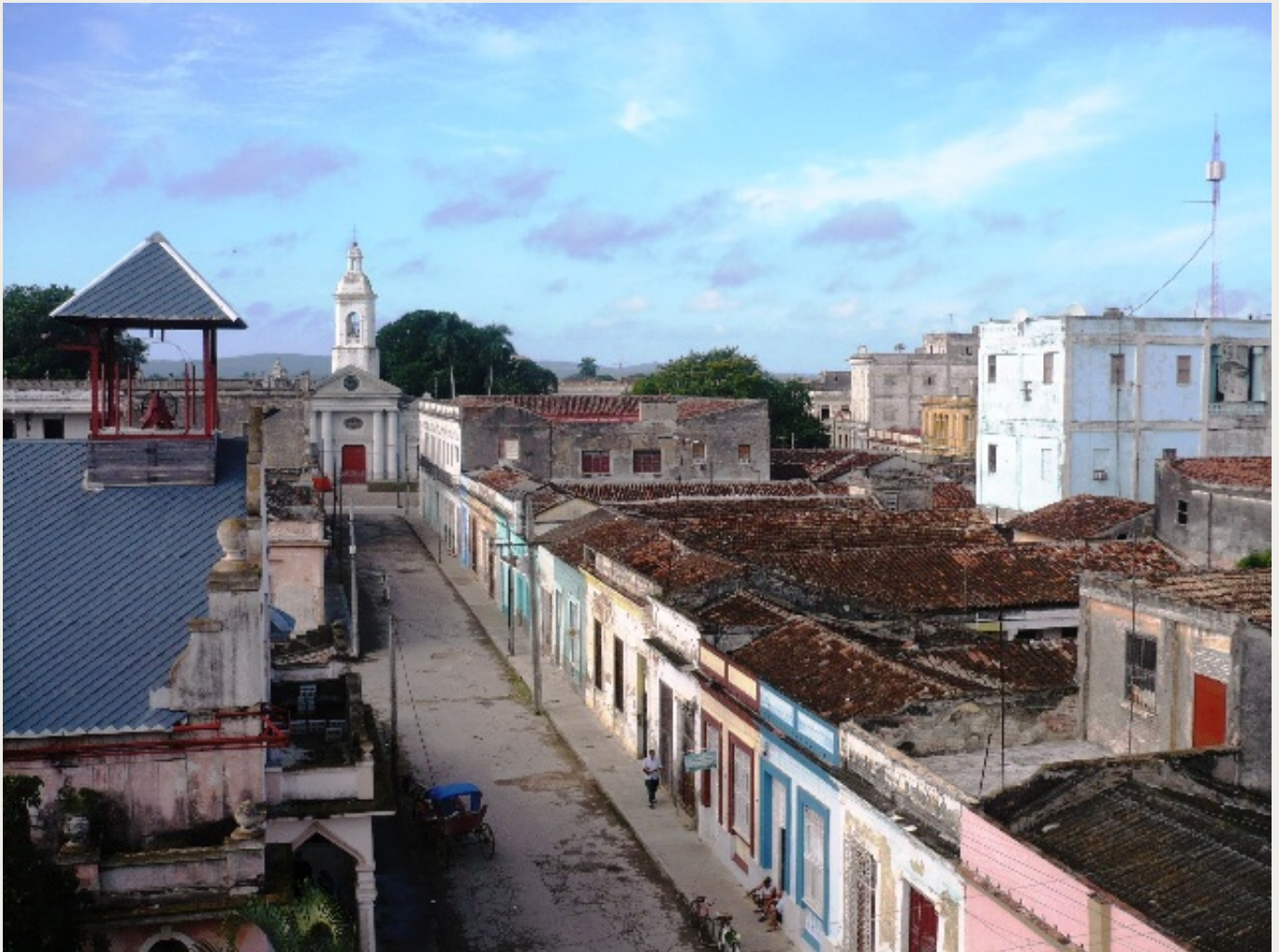
Sagua as of today