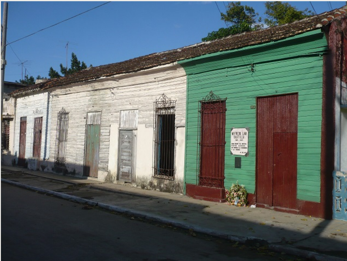
Birthplace of painter Wilfredo Lam