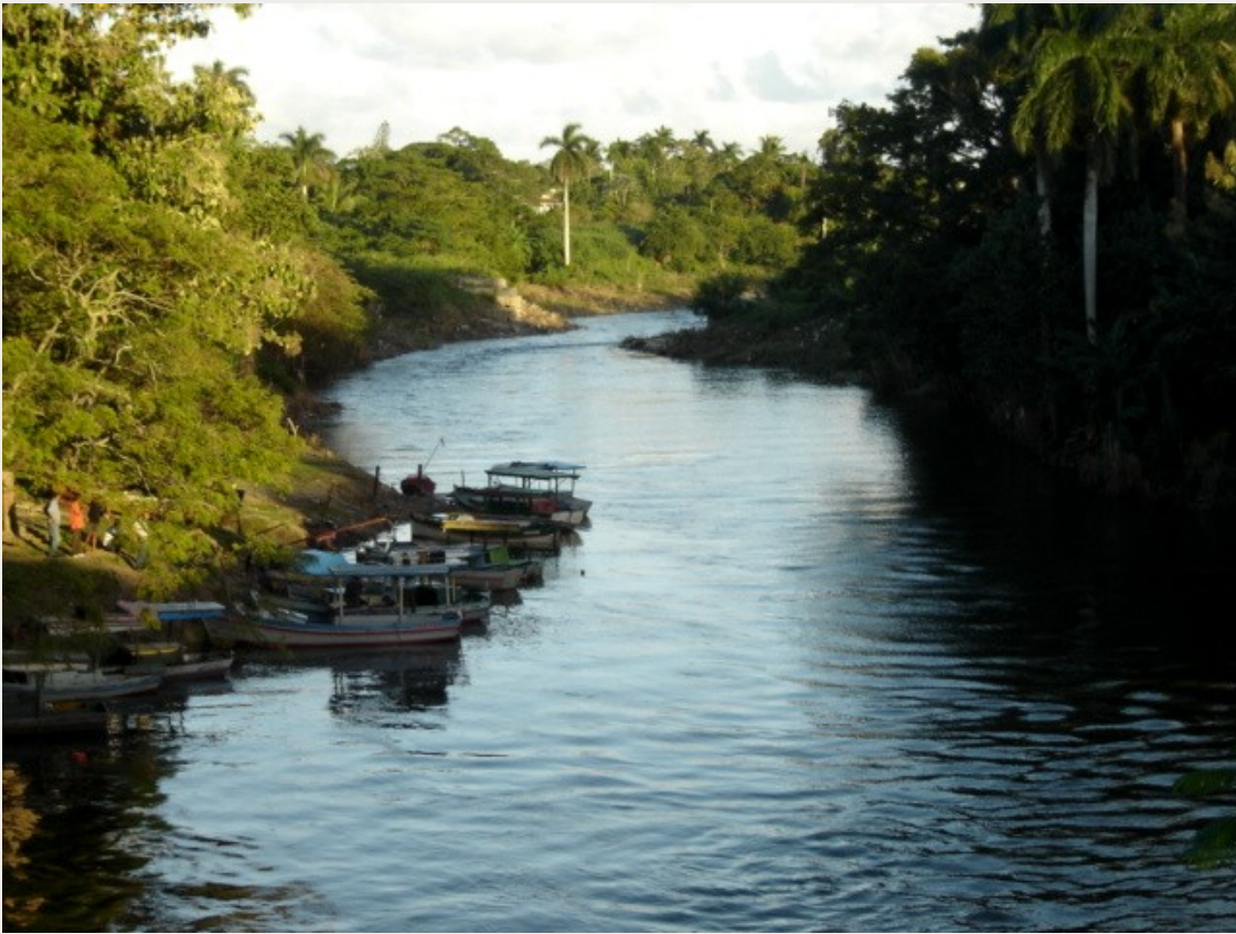
Sagua La Grande River