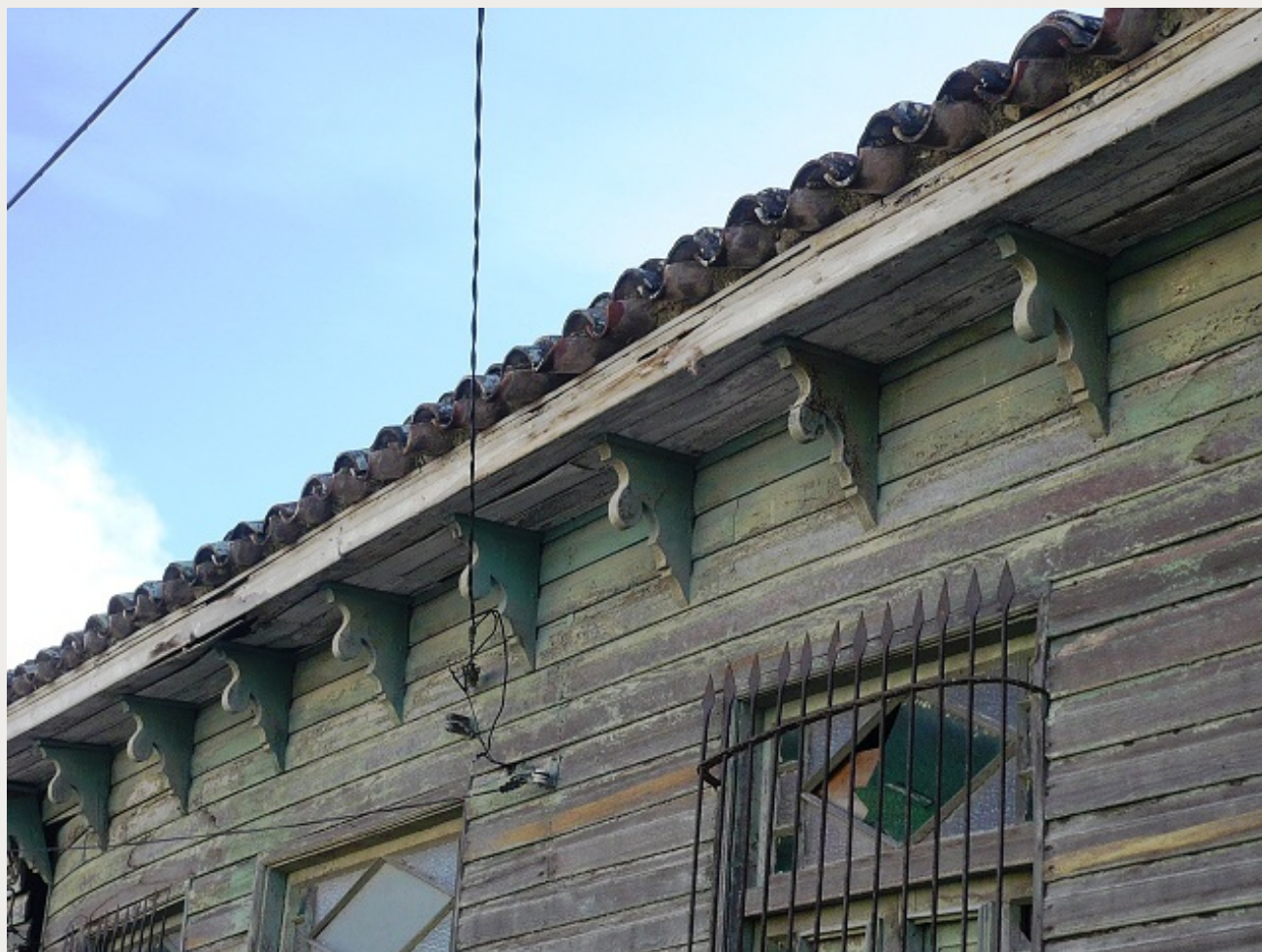
Splashboard detail on the roof.

Inside the constructions we always find a dividing element, almost every time with arches that separate living room from family room. Here like in almost every other town in Cuba and the Caribbean region these dividers are also called medio-punto arches. Along with them, we also find iron grids and stained glass rectangles to top the doorways and windows. This glass door and window tops can be colorless or colorful, but always transparent or translucent, sometimes with geometrical motifs, many other times with radial ornaments.