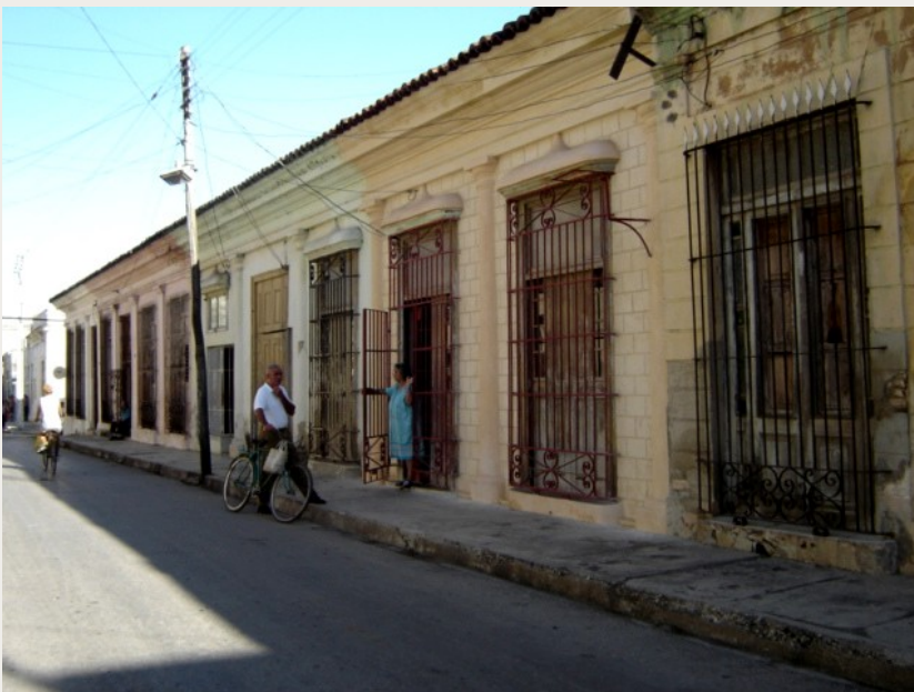
Colonial buildings. s. XIX

Sagua La Grande keeps a very important set of Colonial –XIX century- and Republic – first half of XX century- buildings. Colonial architecture is easily recognized because of the predominance of neoclassical decorative motifs, very delicate and finely executed. Its transition to the XX century is expressed through a very particular eclecticism which gives a great ambient and architectural coherence to the whole of Sagua's historic center. There are also included other expressions of arts in Architecture like Neo Gothic, Neo Colonial, Art Nouveau, Art Deco, as well as Wood Architecture, which is the one I specially want to refer to.