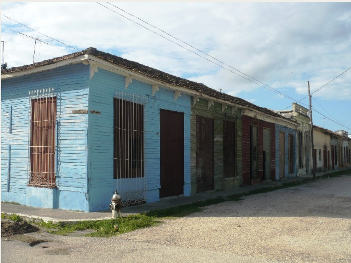
Vernacular wood as continuous constructions

In some areas of the urban screen this wood constructions are built as continuous units divided by party walls, sometimes extending to the whole block and even around the square block. It is very interesting to see the way the splashboards are treated on the roofs of these buildings due to the different solutions used in them. Sometimes a simple piece of board, curved cornices supporting the roof, some other times we see wooden struts and brackets with different figures that sometimes include zoomorphic stylized ones. Traditional Sagüeran ironwork is also always present with a wide array of designs to close the windows and some other parts open in the wooden facades.