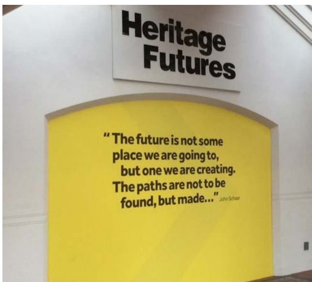
Manchester Museum is showing a Heritage Futures exhibition 14 December 2018 – Autumn 2021, drawing on the results of Heritage Futures Research Project and involving contributions by the UNESCO Chair on Heritage Futures. https://www.museum.manchester.ac.uk/whats-on/exhibitions/currentexhibitions/heritagefutures/