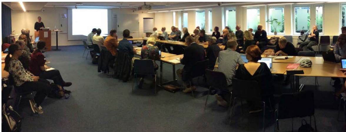
60 experts and stakeholders on nuclear waste, other kinds of hazardous waste and cultural heritage, came together to discuss how best to preserve information and maintain memory over centuries and millennia in the context of sustainable development.