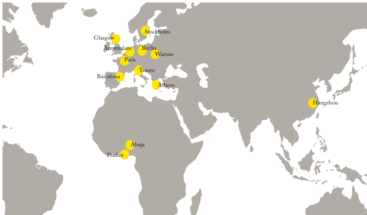
Map of the Chair's activities 09/2018 – 08/2019 (selection)