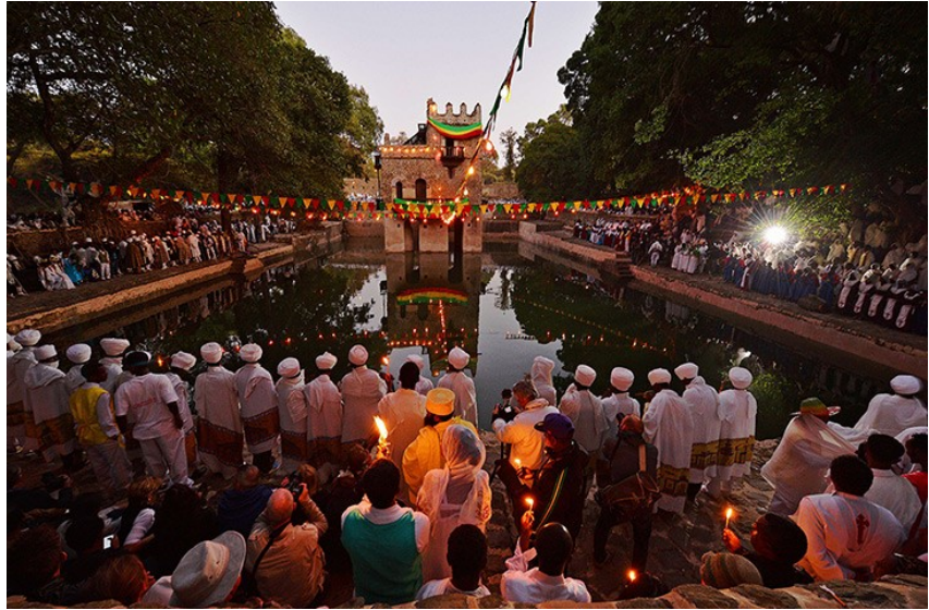
Celebration of Epiphany at the 17 th -century Royal Bath in Gondar World Heritage Site, the most famous location to witness the ceremony

major festivals, such as Epiphany (20 January 2019), the tabots are taken outside the church and carried on the heads of priests, wrapped in cloth. Although it may in origin be a portable altar, the tabot is now understood to symbolise the Ark of the Covenant, the original of which Ethiopian Christians believe to be preserved in a chapel in Axum, where it had been taken by Menelik I in the first millennium BC. In the case of some churches which have later been extended, the whole original building now functions as the maqdas , as in the case of Debra Selam Mikael and Zarema Giyorgis, to be visited on Day 2 (24 January).