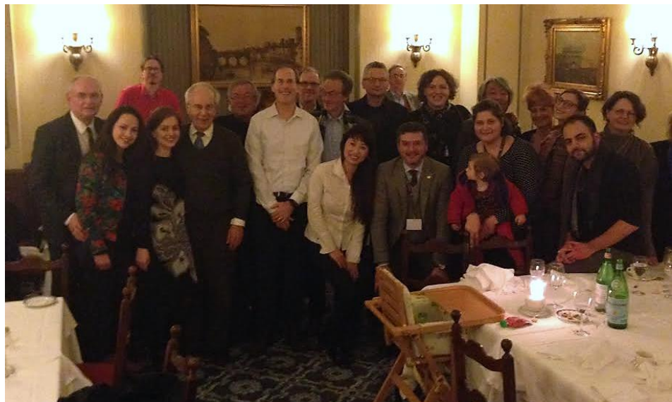
Avslutande middag med en stor del av konferensdeltagarna.

Konferensrapport av Staffan Hansing som deltog i konferensen med stöd av ICOMOS Sverige.